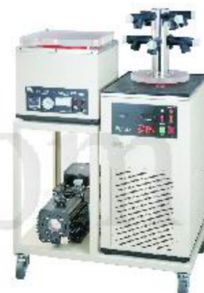
CENTRIFUGAL EVAPORATOR & FREEZE DRYER COMPLEX SET