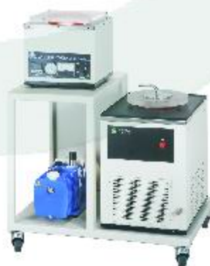
CENTRIFUGAL EVAPORATOR COMPLETE SET